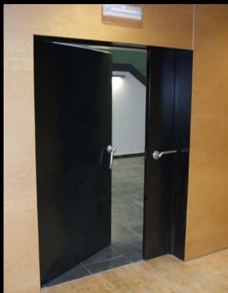
Double doors with unequal leaves