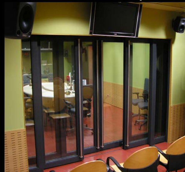
Glazed sliding acoustic doors