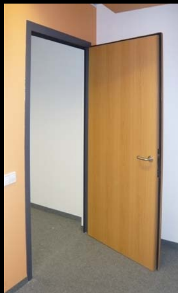
Imitation wood finish