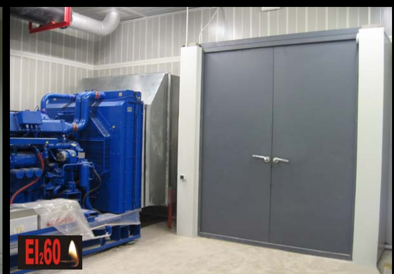
Large dimensions acoustic and fire rated doors