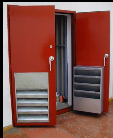
Doors with integrated ventilation louvers